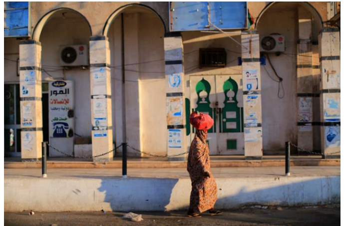
Women carrying a bag in her head in Tripoli.