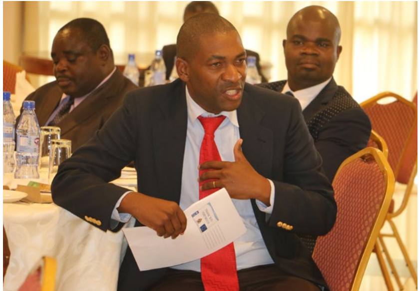
Members of Parliament comment on the findings of the Malawi National Human Development Report