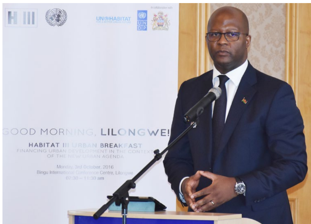
Minister of Lands, Housing and Urban Development- Hon. Atupele Muluzi

as half of Malawi’s urban population will live in urban areas by 2050