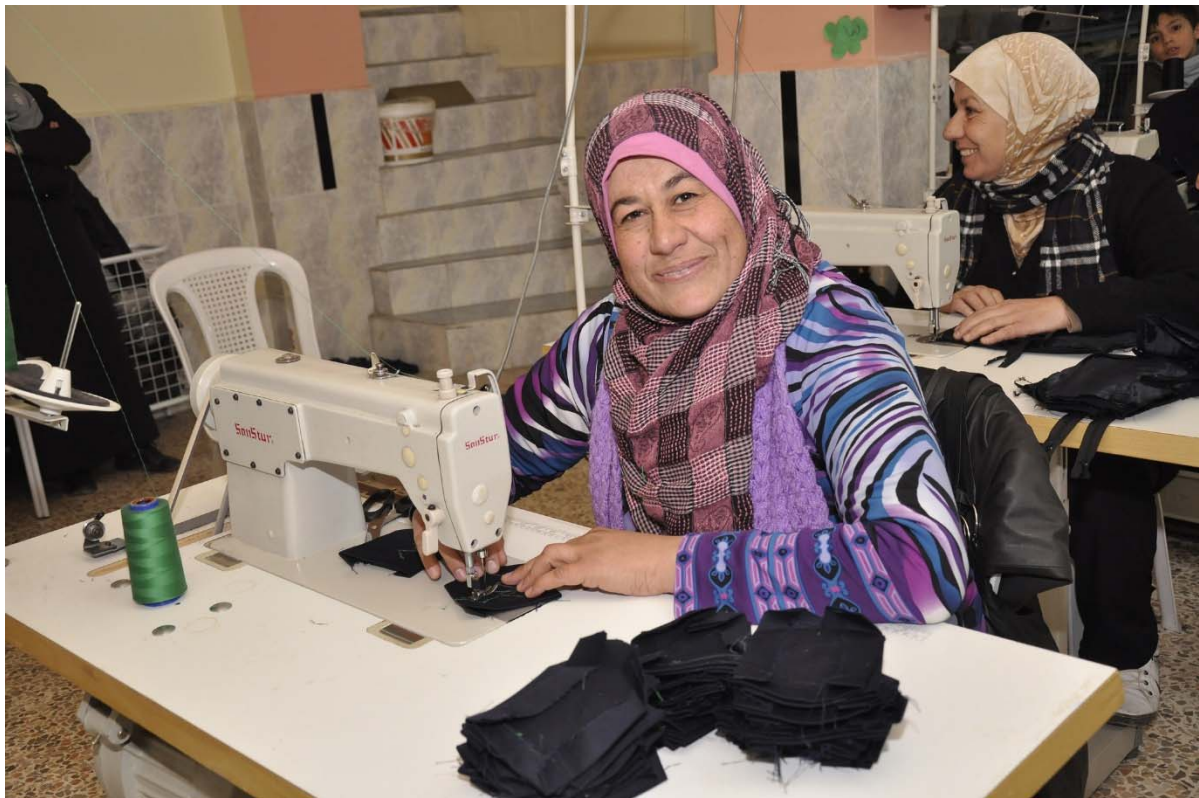
An internally displaced woman sewing as part of a cash for work opportunity provided to her by UNDP in Homs.

Areas that receive sudden and/or large influxes of displaced populations often face significant challenges, especially if there are pre-existing vulnerabilities. For local host communities, a sudden and significant increase in the population can put strains on the existing infrastructure and services, and create competition for limited jobs and natural resources. In Jordan, 84 percent of Syrian refugees live outside camps within local communities, which has led to real and sometimes perceived competition over access to employment opportunities. However, the overall economic impact of Syrian refugees is much smaller and more positive than public opinion would suggest. 19