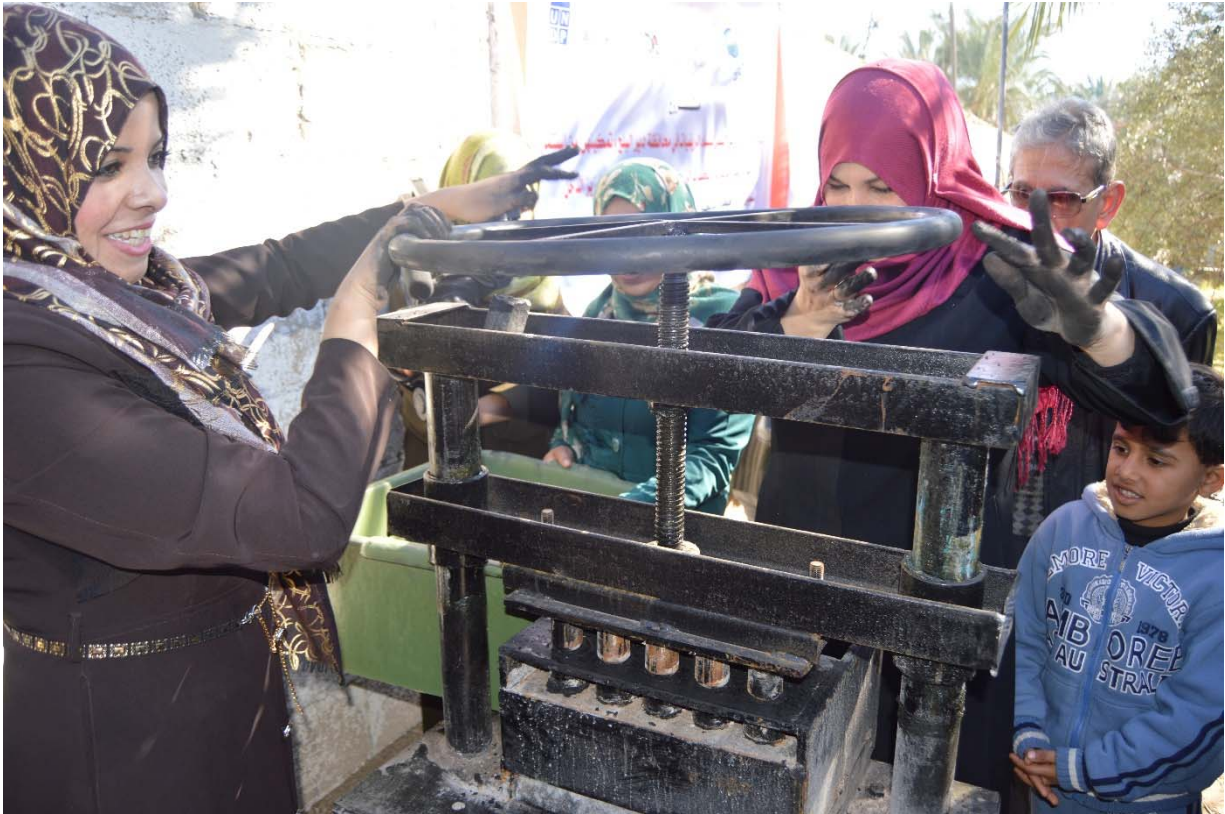
Participants in a UNDP supported recycling programme.

UNDP is the leading development partner for the 3RP for the Syria Crisis Response, a core partner of the UN's Governance response under the Integrated Strategy for the Sahel, and it contributed to the Regional Refugee and Migration Response Plan that is underway in Yemen and Europe. Under the latter, UNDP will convene a conference of host community mayors along the transit route from Turkey through Greece and the Western Balkans in 2016, giving this critical constituency a voice, and local response capacities through cross-country learning and experience-sharing.