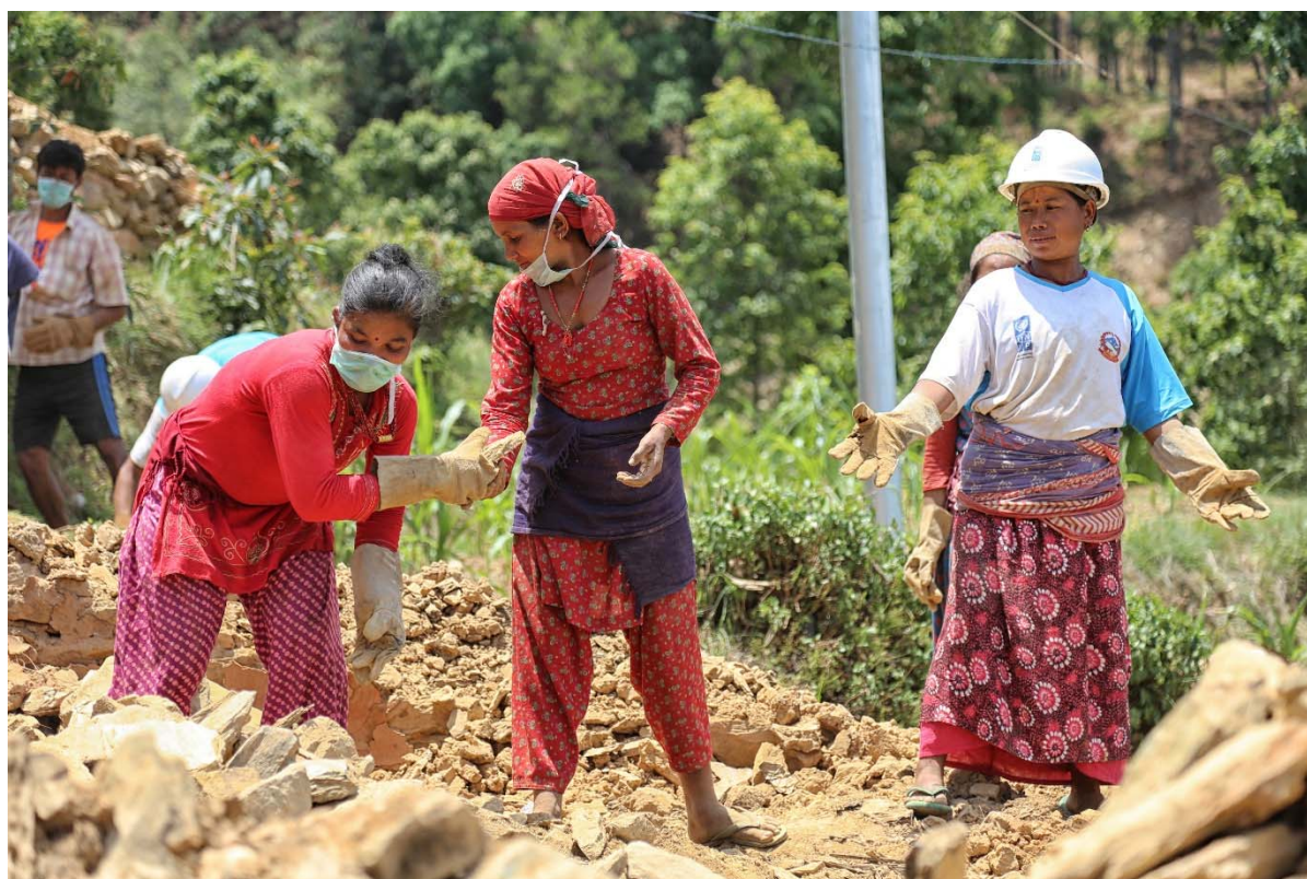
Women participating in UNDP's cash for work programmes after the Nepal earthquake.

The 2030 Agenda for Sustainable Development and the Sustainable Development Goals (SDGs) have put displacement for the first time squarely on the global development agenda. In the declaration, Member States commit “to cooperate internationally to ensure safe, orderly and regular migration involving full respect for human rights and the humane treatment of migrants regardless of migration status, of refugees and of displaced persons. Such cooperation should also strengthen the resilience of communities hosting refugees, particularly in developing countries.” The SDGs also underscore the importance of development investments in preventing and resolving protracted displacement and identifying joint solutions with humanitarian actors that strengthen resilience and minimize dependency.