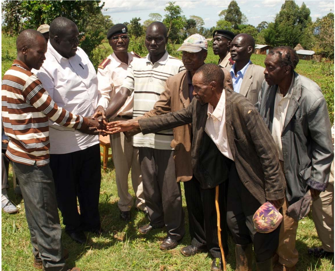
UNDP supported conflict resolution and social cohesion dialogues between rural communities in Kenya.

address displacement: for instance, support to mainstream displacement issues into national development strategies and development planning. It also includes national strategy development for displacement, including UNDPs joint work with UNHCR on Durable Solutions. UNDP, in this capacity as Global Cluster lead on Early Recovery, convenes other UN agencies and organizations in the implementation of the Secretary General's Decision on Durable Solutions. UNDP and UNHCR provide joint technical expertise to support the elaboration of country strategies on durable solutions.