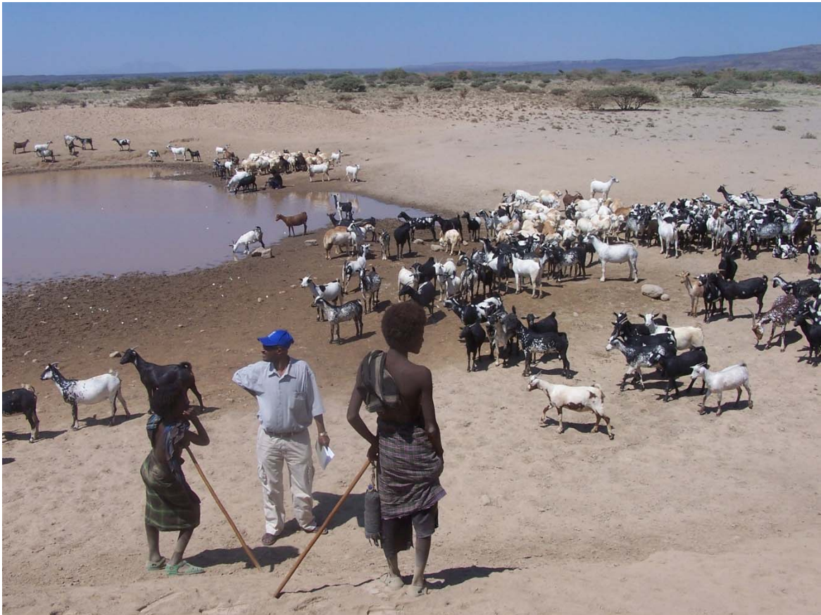
Microdams created with UNDP support to secure pastoral livelihoods.

Employment opportunities, in particular, remain distributed unevenly between, as well as within, countries. The absence of social protection mechanisms, which can help protect against economic and environmental shocks (whether sudden onset or slow, such as drought and limited access to arable land) exacerbates these tensions and increases forced displacement.