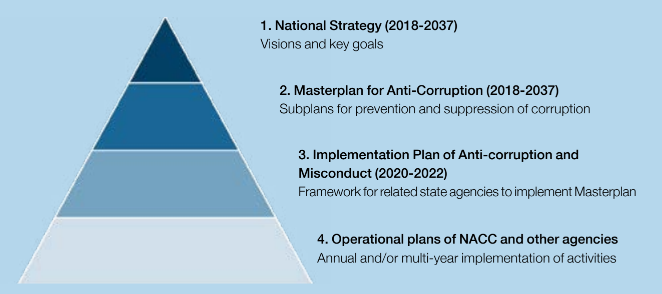
Figure 1: National Anti-Corruption Framework Thailand

The first level (National Strategy 2018-2037) was presented by the Prime Minister and received Royal Assent. It establishes the vision 2037 "Thailand becomes a developed country with security, prosperity and sustainability in accordance with the Sufficiency Economy Philosophy" and defines six key goals to achieve it.