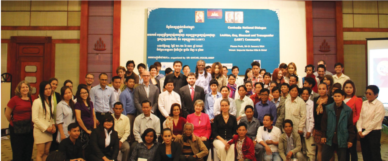
Photo: The participants of the Cambodia National LGBT Community Dialogue