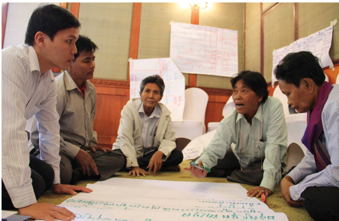
Photo: Group discussion activity at the National Dialogue

HIV work, particularly with MSM and transgender people, has opened opportunities for LGBT health and rights advocacy in Cambodia. Many years of work on HIV with MSM (many of whom are self-identified as gay) has led to an increased understanding in Cambodian society about different sexual orientations and gender identities and of the higher levels of discrimination faced by those who challenge traditional gender norms. HIV work has also increased focus among MSM and transgender people on communities and a sense of belonging, which are crucial to mobilizing people beyond their categorization by sexual acts into ‘risk groups’. There is gradual recognition in Cambodia that HIV is just one issue faced by MSM and transgender people and that this is linked to underlying discrimination, exclusion and marginalization. However, various studies, including on sexual and reproductive health and rights and gender-based violence, show that population groups like lesbians are excluded from HIV discussions.