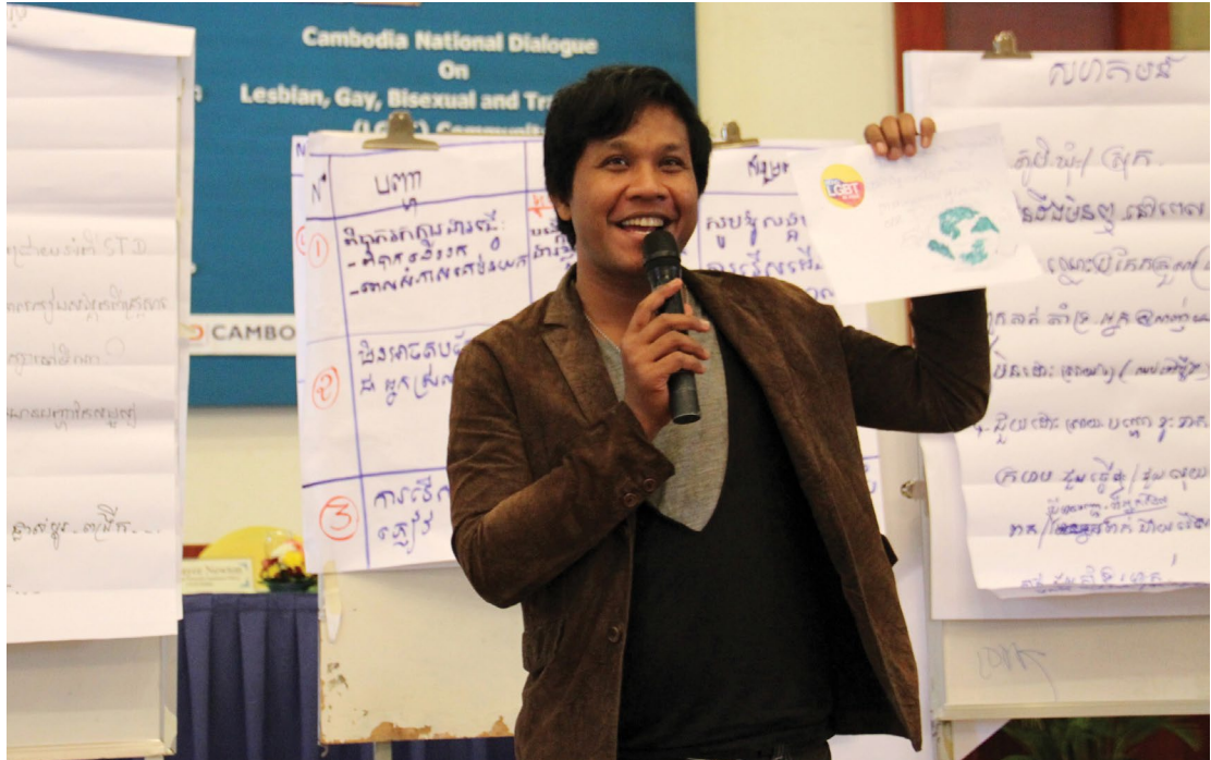
Photo: 'Share Your Voice' Activity at the National Dialogue

The Social Exclusion Report (2013) recommends several areas for research, in order to inform future policy development. More information is needed about younger LGBT persons (12–18 years), as this is when gender orientation and sexual expression start to be recognized. At these ages, young people are most vulnerable to shocks such as violence, bullying, and being thrown out of the house or schools. Another subset of the LGBT population for further research are older LGBT persons (age 50 and up) who may have no family or children, are isolated, and are not entitled to government support through social protection mechanisms.