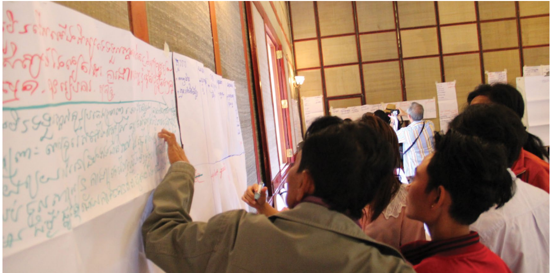
Photo: Sharing of 'Life Line' Activity at the National Dialogue

No government institutions work specifically on LGBT rights. All Cambodians are theoretically to receive equal treatment under the Constitution, the supreme law of the land, regardless of sex, age, race or religious beliefs. The Cambodia National Human Rights Commission has not been involved in LGBT issues, and did not comment on LGBT rights issues raised in reports to the UN Human Rights Commission (UNHRC) for the 2013 UPR.