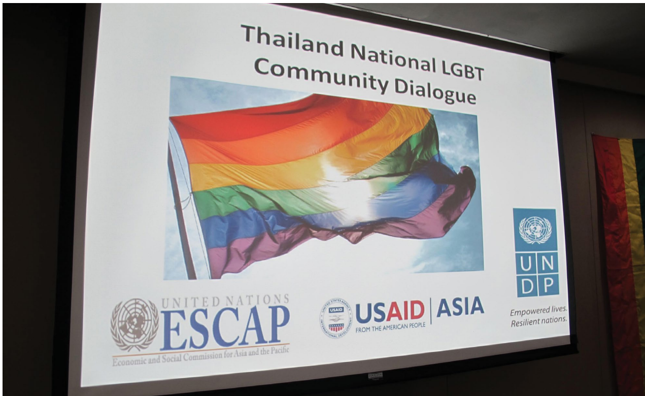
Screenshot of the sign for the Thailand national LGBT community dialogue