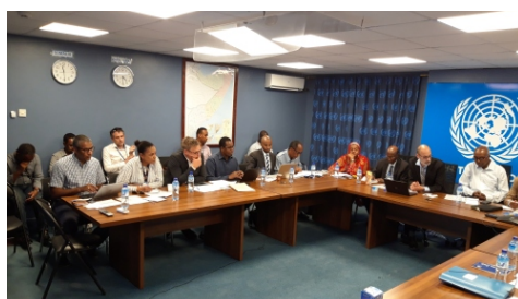
On 13 September 2018, Project Board Meeting for Constitutional Review Support Project held in UN office, Mogadishu