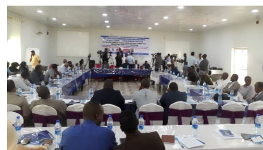
On 9-11 October, 2nd Forum of Parliament Oversight (OC) Committee in Garowe, Puntland