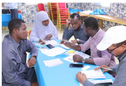
On 1-4 September, a ToT on Civic Education and Public Outreach held in Gulmudug