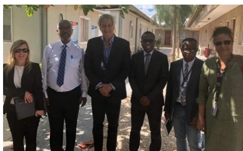
On 11 October, New UN Special Representative of the Secretary-General (SRSG) H.E. Nicholas Haysom meeting with Ministry of Constitution on Review Process