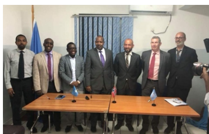
On 26 September, a signing ceremony for CRSP II held in Mogadishu