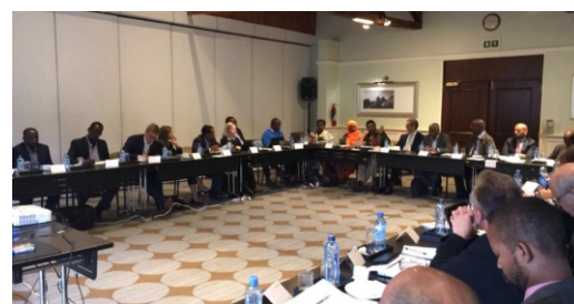
On 13-19 August, Retreat on the way forward of Constitutional Review Process