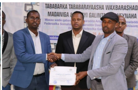
Participants from Galmudug & Hirshabelle attending Training of Trainers (ToT) on Civic Education and Public Outreach, Adado & Jowhar, September, 2018