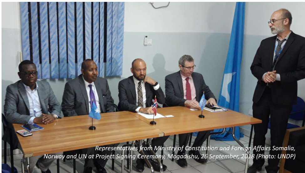
Representatives from Ministry of Constitution and Foreign Affairs Somalia, Norway and UN at Project Signing Ceremony, Mogadishu, 26 September, 2018