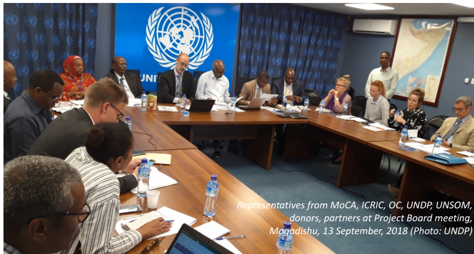
Representatives from MoCA, ICRC, OC, UNDP, UNSOM, donors, partners at Project Board meeting, Mogadishu, 13 September, 2018

Advisor, UNDP Inclusive Politics Portfolio, presented the key achievements of the CRSP II project, which included the completion of the review of the first five chapters of the constitution. She informed those attending that joint public consultations involving the three key players will be conducted soon in FMSs and CSOs. She further said, to ensure inclusivity and wider participation in the review process, three platforms have been created listing MoCA Forum, Oversight (OC) Forum, Joint Meeting by key players.