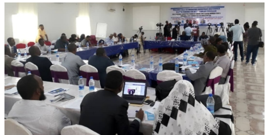
Glimpses of second Parliamentary Oversight (OC) Committee meeting held in Garowe, 9-11 October, 2018