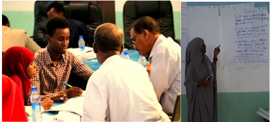
Participants from MoCFAD engaged in group work exercise during training on Constitution Review Process, Garowe-Puntland, 21-22 October 2018, (Photo UNDP)

Recommendations from the training included to organize public consultations and civic education trainings, as well as strengthening cooperation among stakeholders.