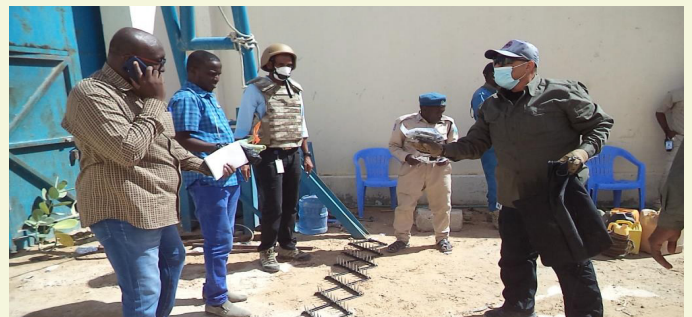
Mogadishu: 10 December 2020: IESG and UNSOS staff brief NIEC security staff on use of spike strips

IESG provided a number of capacity building/training opportunities to NIEC staff to support operations, including: performance management and training development for the Human Resources Department (14 December 2020); procurement evaluation procedures (21-28 December 2020 and 18 January 2021); electoral materials supply chain management training (28 December 2020); M&E plan, data collection and reporting (2 December 2020); managing teams (7-10 December 2020 and 19 January 2021); ICT (six weekly sessions in December 2020 and January 2021); and security training (10 and 13 December 2020).